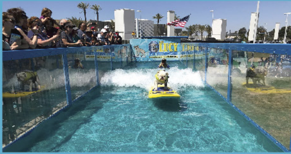
Add a platform for up-close public viewing. (not included)

Pull in huge crowds with this one-of-a-kind attraction!