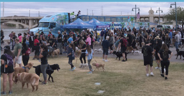
At pet friendly events, dogs in attendance can try out surfing on the wave maker!